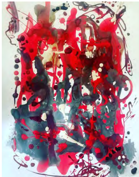
Original Artwork by Sabiyha Prince, sabiyaPrince.com . Or on Instagram as SabiyhaPrince