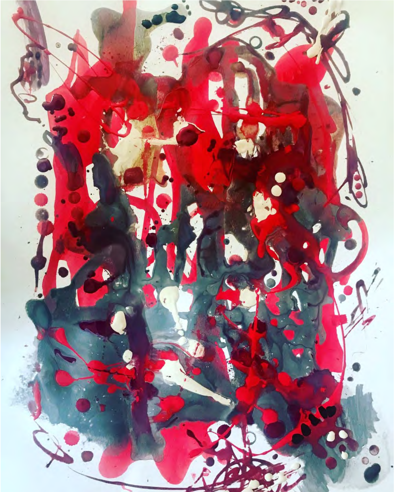
Original Artwork by Sabiyha Prince, sabiyaPrince.com , or on Instagram as SabiyhaPrince